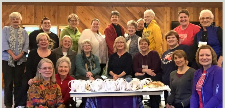
Women's Weekend was held Feb. 20-21 at Silver Falls.

The Reiki gathering scheduled for March 13 has been postponed.