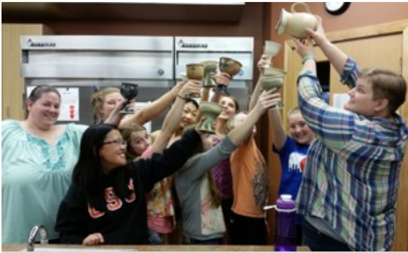
Our youth have been learning what it means to be part of a Disciples of Christ church.